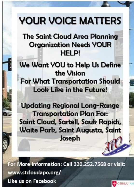
Figure A3: Early Public Outreach Advertisement.

Below is a complete timeline of public participation activities from the early public outreach stage to the final public participation events for the MTP.