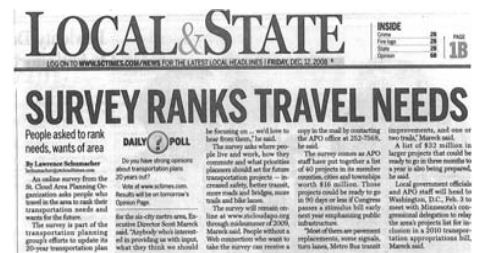
2035 Transportation Plan Survey Article

St. Cloud Times Public Open House Notice