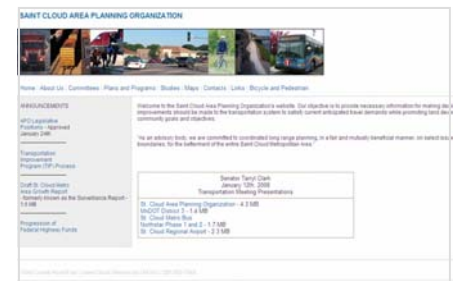
St. Cloud APO website