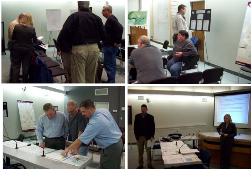
Sample Photos from 2035 Transportation Plan Meetings & Workshops

Public participation does not stop with development of the Transportation Plan; participation and input will continue as specific projects, policies, and programs evolve.