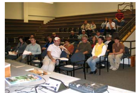
APO Public Meeting