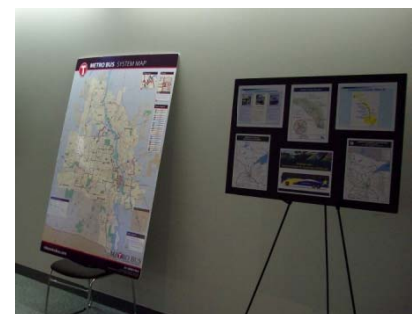
2035 Transportation Plan Metro Bus Transit Public Meeting Board