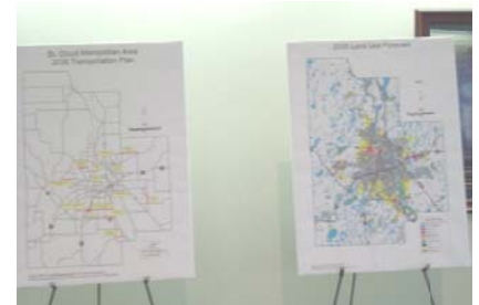
2035 Transportation Plan Roadway & Land Use Public Meeting Boards