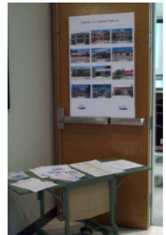
2035 Transportation Plan Public Meeting Handouts & Sign-in Sheet